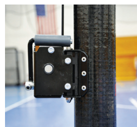
Uprights with Winch