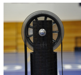
Recessed Pulley Wheel