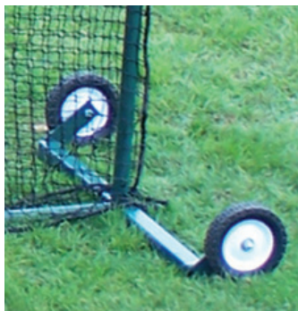
Shown with optional wheel kit