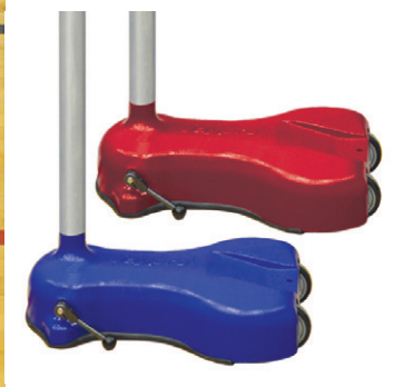
GymGlide™ base color options: