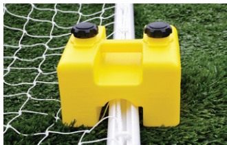
World Cup™ anchors