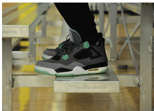
Single Foot Plank