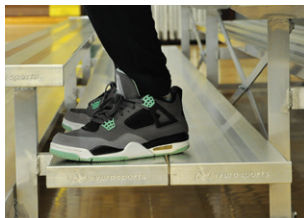
Double Foot Plank

TIP-AND-ROLL STANDARD BLEACHER TIP-AND-ROLL PREFERRED BLEACHER