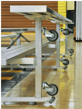
Back of Bleacher with non-marking swivel casters and foot pad protectors