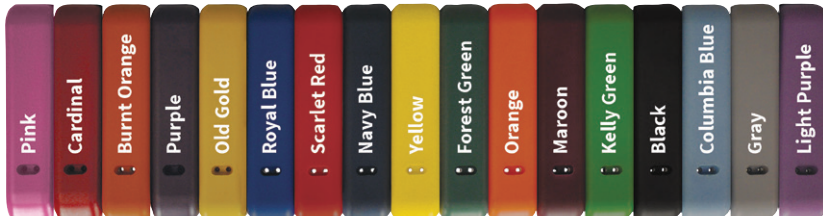
(MBBP-6XX) Bolt-On Safety Edge Padding