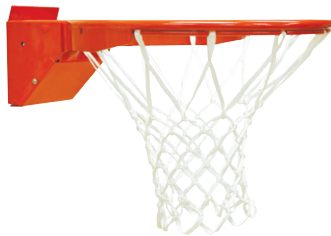
(GBA-642) Adjustable Breakaway Goal