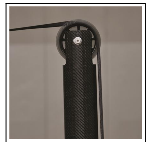
4" DIAMETER POLYCARBONATE PULLEY WHEEL