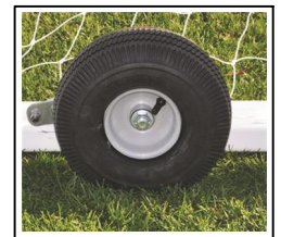
INCLUDES WHEEL KIT (NO-FLAT TIRES)