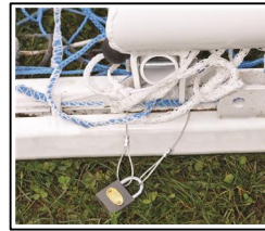
LOCKING MOUNT w/ LANYARD (WITH CUSTOMER SUPPLIED PAD-LOCK)