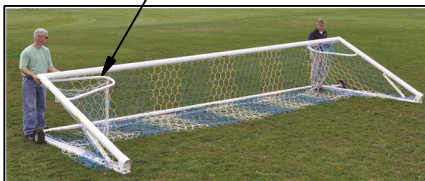
PATENTED SPRING AIDED DESIGN